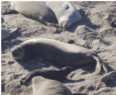
Can you see why they are called elephant seals?

Elephant seal - Every winter elephant seals come to San Simeon, in order to give birth to their babies. They are big and, they make a strange noise. Males are bigger than females, and it's interesting to see how they court females because they strength their necks to attract the females.