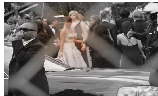
Penelope Cruz at the Oscars