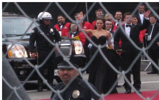
Can you see Angelina Jolie and Brat Pitt?